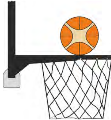
Diagram 2 Ball in contact with the ring

31-18 Statement. An interference violation is committed by a defensive or offensive player during a shot for a field goal when a player touches the basket (ring or net) or the backboard while the ball is in contact with the ring and still has a chance to enter the basket.