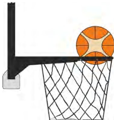
Diagram 3 Ball is within the basket

31-24 Statement. It is an interference violation if a defensive player touches the ball while the ball is within the basket.